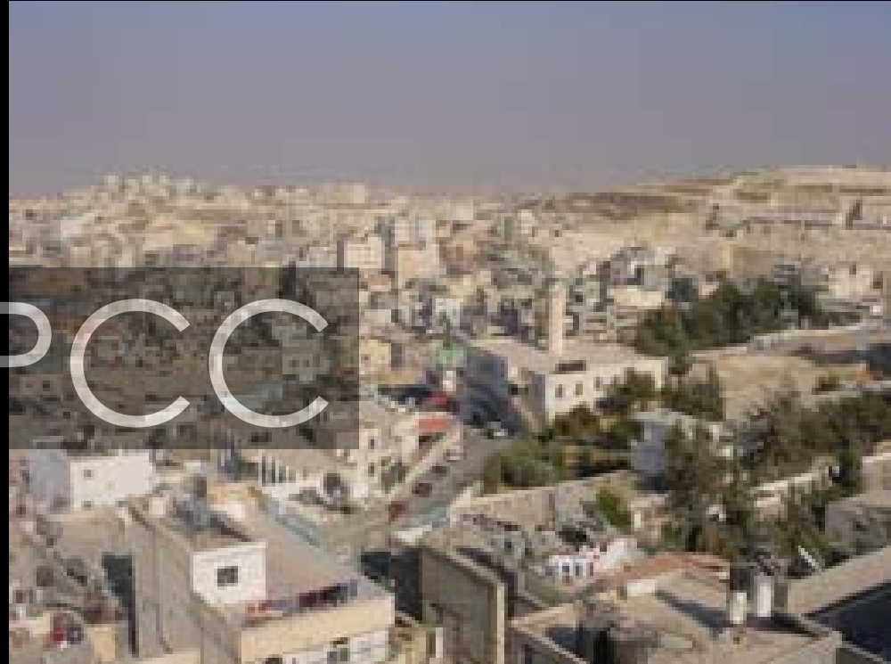
Rehabilitation of the Shu'fat RC