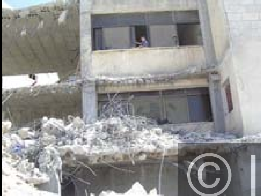
Enforcing Law and Order